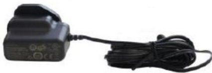
AC Adapter with UK & EU plugs