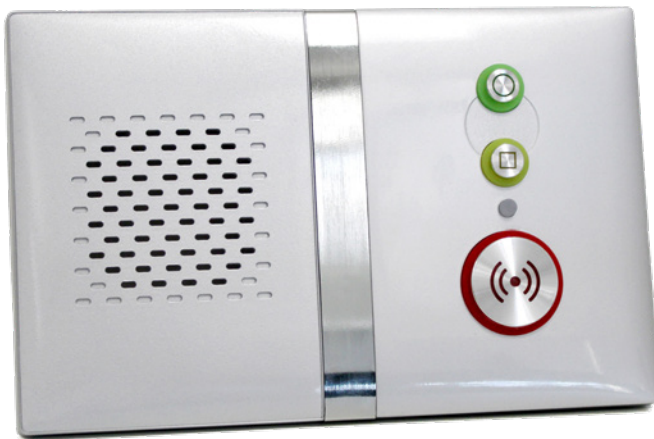
Reach IP Unit