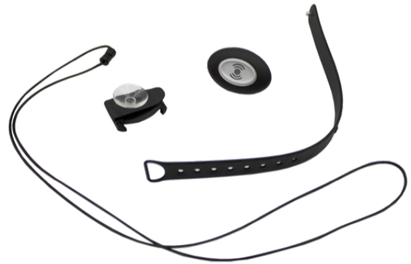
Touch 2 Pendant & Wearing Options